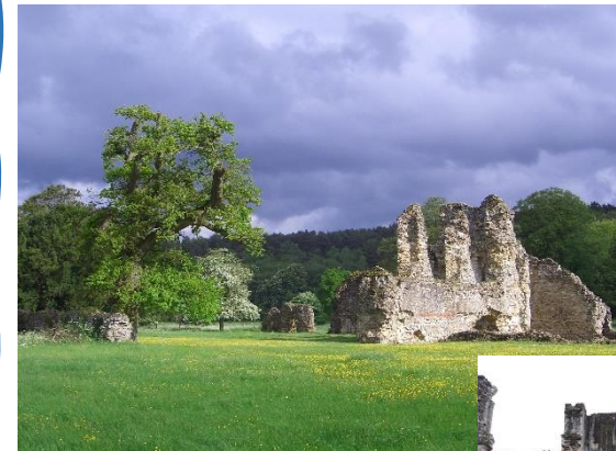
Top: Waverley Abbey , Middle: Rievault , Bottom: Fountains .

Bernard loved to pray more than anything else, and this constant call to be with Jesus showed in the way he treated other people and the way he ran his community. At first, he was so passionate about living a strict and pure life, it was too much for his community who began to grumble and lose faith. Bernard saw that not everyone was called to that level of discipline, and he relaxed some of the rules. When he wasn't praying, Bernard was teaching and supporting his community and a lot of his sermons have survived. Bernard did not enjoy good health and was often so ill that everyone thought that he was going to die. However, he lived to the age of 63, a good age then. He was canonised in 1174, only 21 years after his death, and was declared a doctor of the Church in 1830.